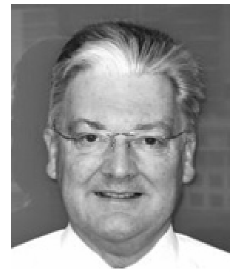
SCAM TARGET: Internet scammers tried to tell Revenue Minister Peter Dunne he was due a tax refund.

Our message: If it's internet, just delete. If it's phone, just hang up. If you're not sure, ask for the name of the caller, their business name and phone number to ring them back. If they are genuine you can check the name and number in Yellow/White Pages. And, if you have a relative or friend who might be vulnerable to these tricks, show them this article.